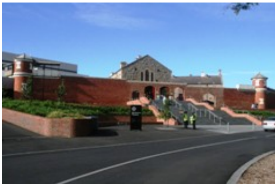
Above: The entrance to Ulumburra; the old Bendigo Gaol.